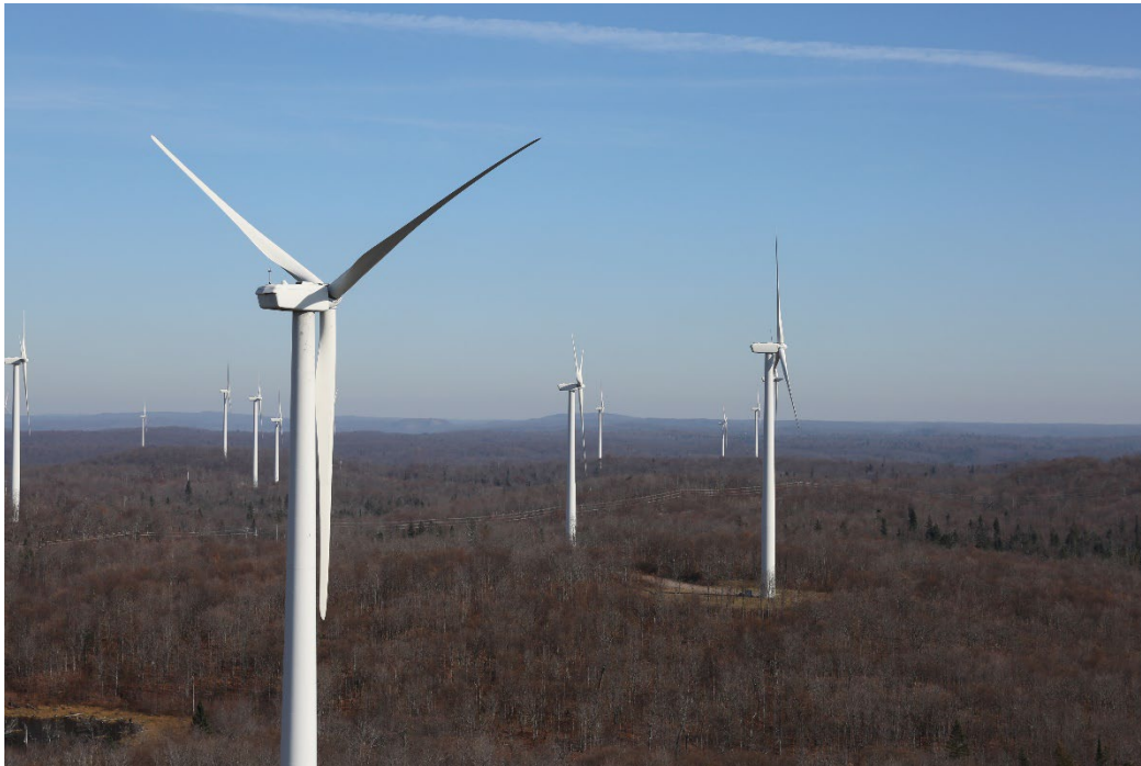
Prince Wind Farm, Author is Stiles Creative.